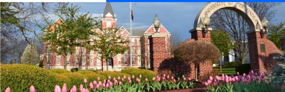
UNIVERSITY OF FINDLAY

"I feel like Towson University is a really big university, but you also feel it is a small university in terms of professors and classmates."