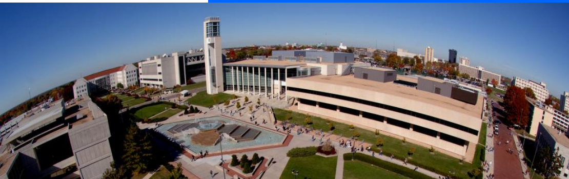
MISSOURI STATE UNIVERSITY

“Through a peer mentoring group at Mizzou I got to know very many students from different cultures.”