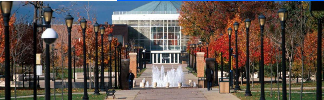
COLLEGE OF STATEN ISLAND

“At Luther, I have been challenged to explore the ways in which I combine my studies and individual efforts with the insights and actions of those around me.”