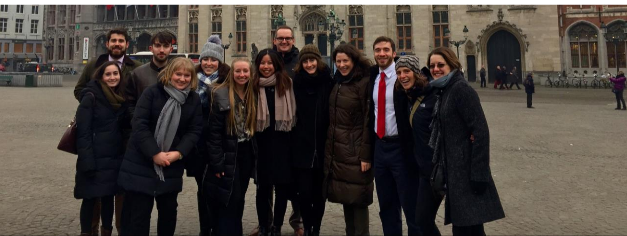
U.S. FULBRIGHT GRANTEES IN CENTRAL AND EASTERN EUROPE, BRUGES