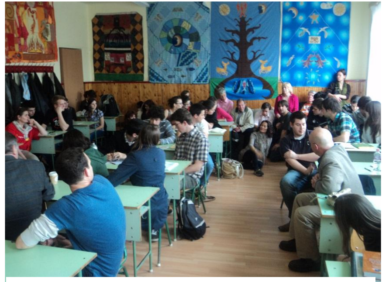
U.S. grantees and students, Ady Endre High School