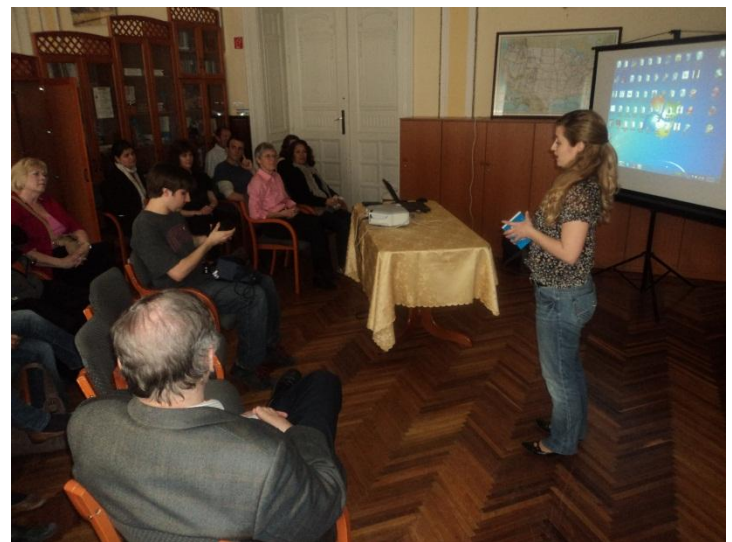
American Corner, Debrecen