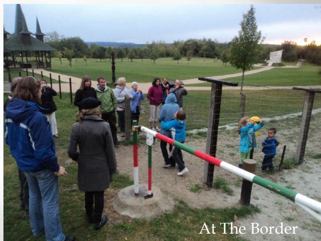
At The Border

October 7 – 8 Fulbright Meeting - US grantees visited West Hungary.