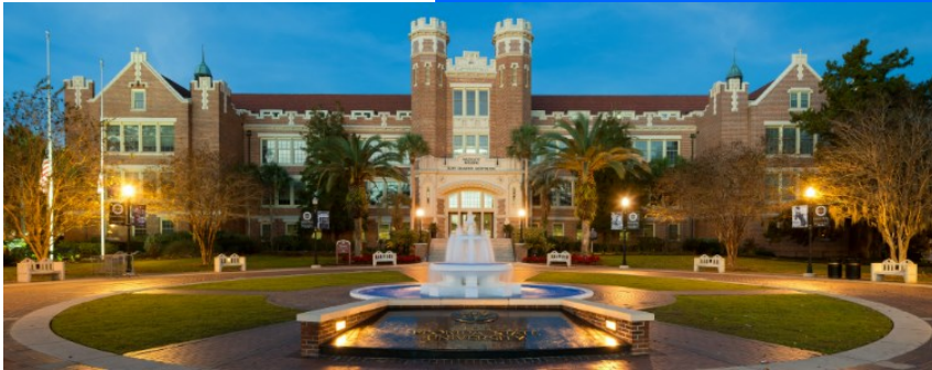
FLORIDA STATE UNIVERSITY