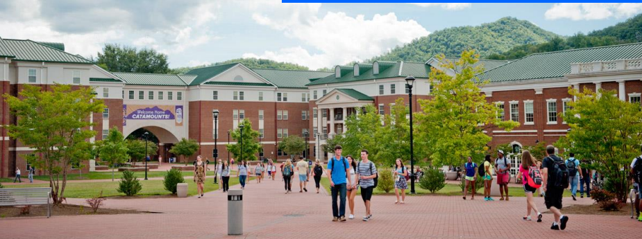
WESTERN CAROLINA UNIVERSITY