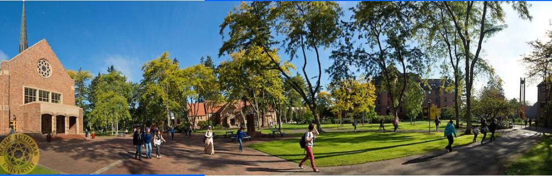
PACIFIC LUTHERAN UNIVERSITY

“Leadership is within everyone, it is for everyone, and by engaging with students you are simultaneously enhancing your own self-growth and development during college.”